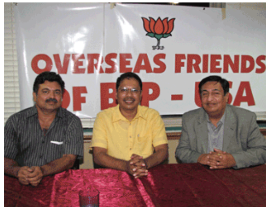
decades and was able to unseat the Congress candidate by more than 136,000 votes.

He decided to contest on the BJP ticket for a seat that had been ruled by Congress Party for decades and was able to unseat the Congress candidate by more than 136,000 votes.